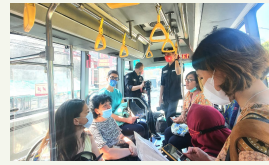
Inside a BRT