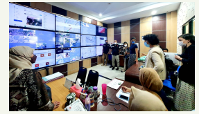
Bus Operations Control Centre