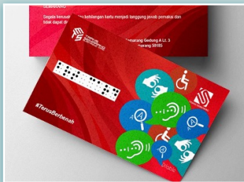
Bus travel card with Braille reading