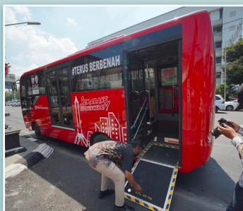
Low-entry wheelchair bus