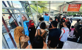
At the bus stop

Delegates from the City of Sofia (Bulgaria) took a bus tour of Semarang City (Indonesia)